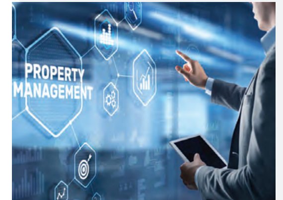
Keppel Land is reinventing the way it delivers value to its customers, leveraging the latest technologies.

As Keppel Land transforms from a brick-and-mortar developer into an asset-light solutions provider for urban spaces, it is also reinventing the way it delivers value to its customers.