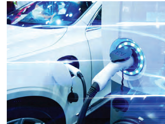
We are building new energy systems and creating new business models such as Energy-as-a-Service to meet our customers' needs.

In 2021, Keppel Infrastructure (KI) established the KETC as its technology and innovation arm. KETC aims to harness technological foresight and accelerate innovation and technology development with the goal of positioning KI at the forefront of the energy transition to capture opportunities presented by this macrotrend.